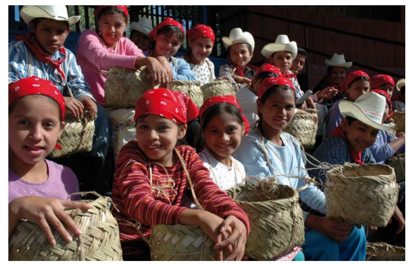
The children of coffee producer members of the Unión de Cooperativas Agropecuarias (UCA) SOPPEXCCA in Jinotega, Nicaragua waiting to perform a coffee picking dance for visitors.

In order for civil society to grow and strengthen, it must operate in an enabling environment. Governments have a key responsibility for creating the conditions that enable civil society to grow and flourish. This includes respect for the right to freedom of peaceful assembly and association, and the right to freedom of expression. In addition, the state can create positive conditions through legislation and regulation that support the role of civil society and encourage citizens' participation.