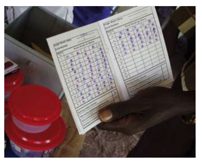
A member's record book from a savings and loans group in Uganda

This policy recognises that civil society organisations do not automatically make a positive contribution to society; not all forms of organisation are inherently good and progressive. Some organisations and movements within civil society can be a source of conflict where they represent narrow sectional interests; they can display intolerant, sectarian and anti-democratic tendencies. Cognisant of this, Irish Aid will make distinctive choices based on shared values and a sound understanding of the vision and mission of all partners.