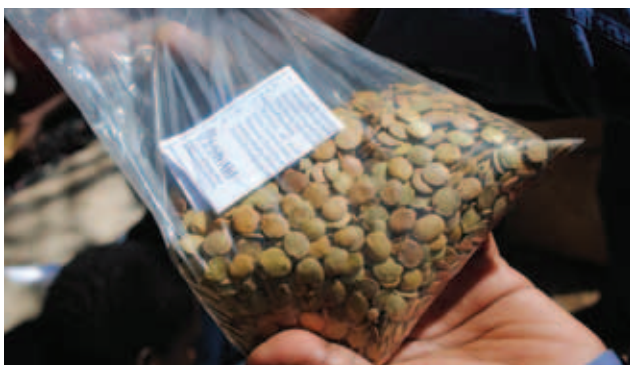
Irish Aid supported agroforestry seeds.

Irish Aid also supports the International Crops Research Institute for the Semi-Arid Tropics (ICRISAT) which focuses on partnerships between farmers, seed traders and government to improve the availability of, and access to, improved varieties of legume seeds. Cooperation with the World Agro-Forestry Centre (ICRAF) is aimed at increasing food security, income and livelihood opportunities for rural communities through the use of technologies that enhance soil fertility and promote sustainable land management practices. Irish Aid supports the National Smallholder Farmers Association of Malawi (NASFAM) in rolling out a national programme to promote the principles and practice of conservation farming among smallholder farmers.